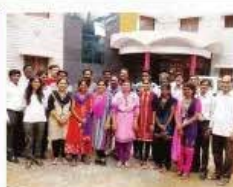
A review meeting towards the road to success