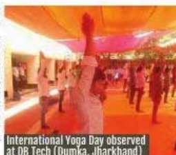
International Yoga Day observed at DB Tech (Dumka, Jharkhand)